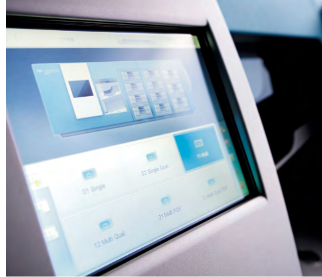
Top: The touchscreen monitor and graphical user interface make the BPS C4 easy and intuitive to operate.